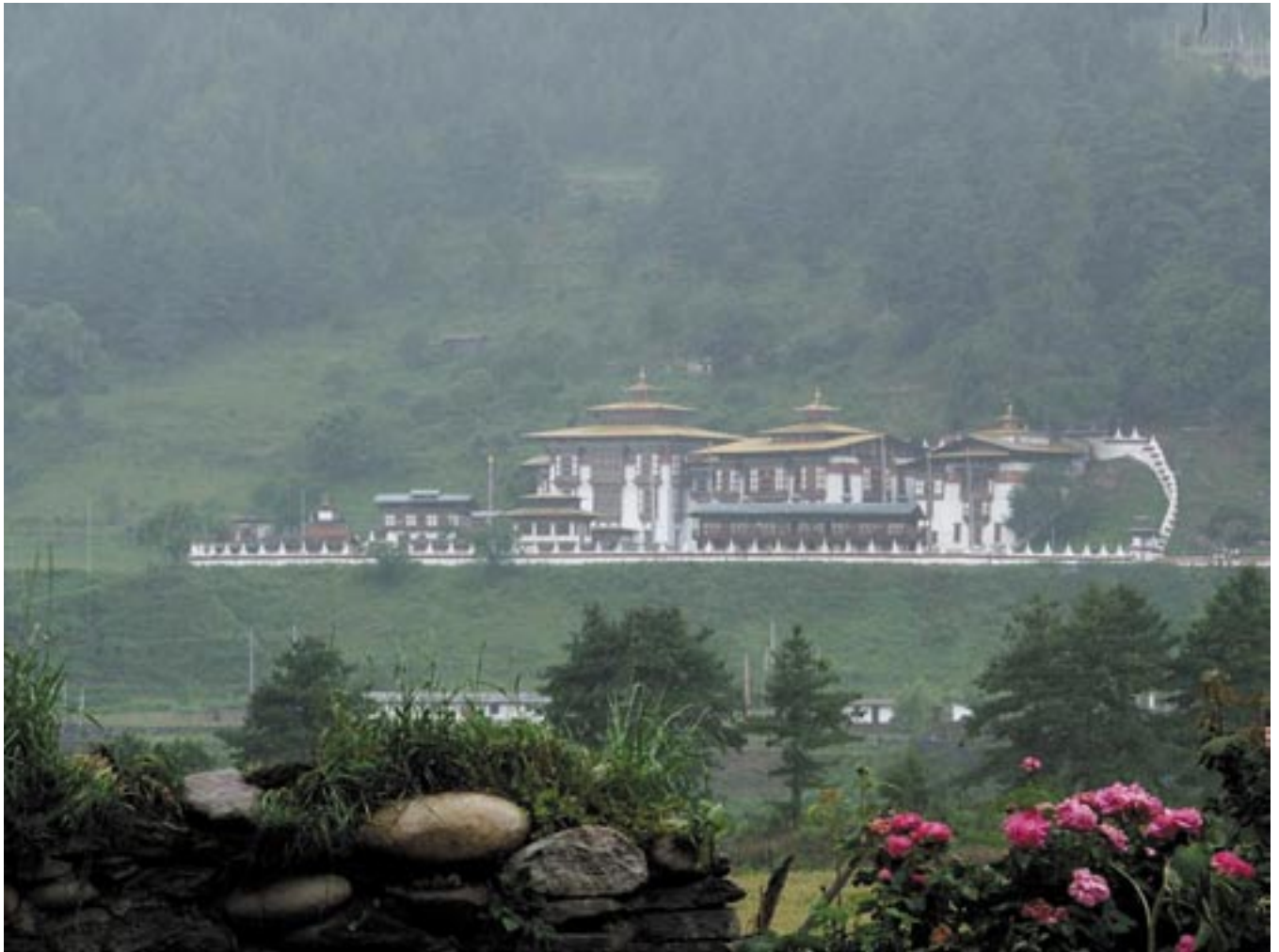
Kurjey Lhakhang, Bumthang