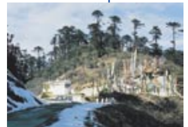
Thrumshing La Pass Elevation 3779m