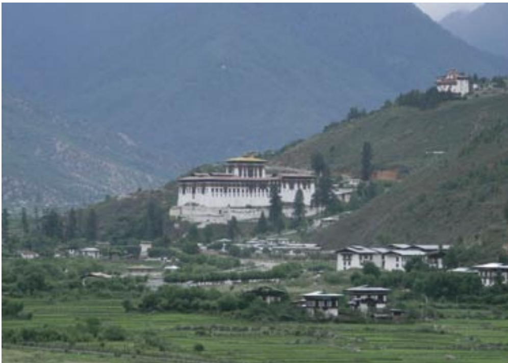
Rinpung Dzong, Paro

The differences between East and West Bhutan are as great as the high pass that separates them. Like the Scots and the English, there are subtle but important differences. The journey from Bumthang to Mongar is one of the most beautiful in the Himalayas, crossing about 3779m high Thrumshing La pass. The descent from Thrumshing La to Limithang is astonishing for several reasons. The road drops from 3779m to 650m in only a few hours passing from pine forests through semi-tropical forests, to orange groves.