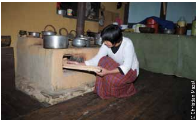
A prototype rural clay stove in Phobjikha.