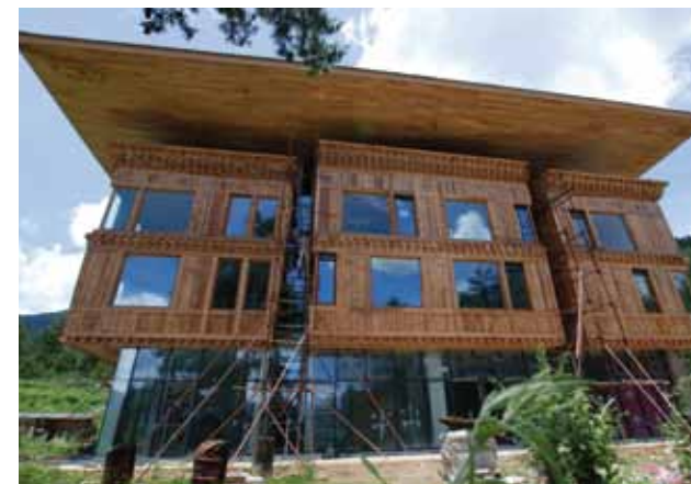
The 4-star training hotel is close to completion.

The last and most challenging part of the construction project is the construction of a new hotel building which will serve as a training hotel for the students of the RITH. The strict building rules in order to conserve “traditional looks” with a large number of rabsey (light weight timber frame constructions with window openings) were very demanding for the energy optimised building standards. Ms. Irene Ott-Reinisch, the Austrian architect, had to reconcile Bhutanese tradition and innovation. “Building on our experience gained in the renovation of the Training Institute, I had to develop a new interpretation of the traditional Bhutanese farm-