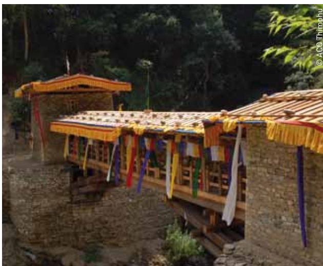
Inauguration Cantilever Bridge 2007

(mainly mica schist) and failing foundations. The renovation work started in 2005 and turned out to be much more difficult than anticipated. In July 2006 a portion of the three metres thick walls of the main tower collapsed, leading to a complete reconstruction while trying to retain the historical character and unique appearance of the building.