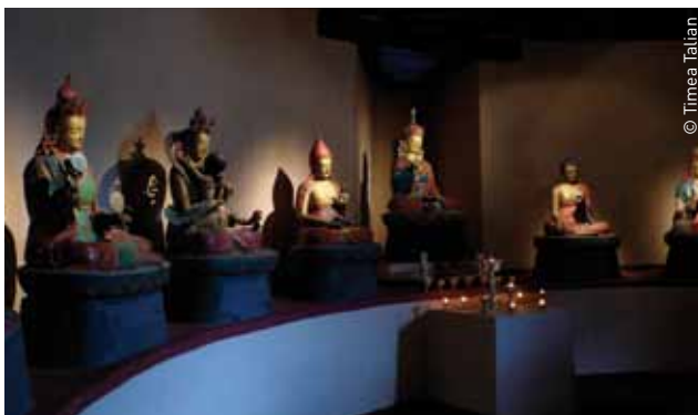
Exhibition in the Ta Dzong