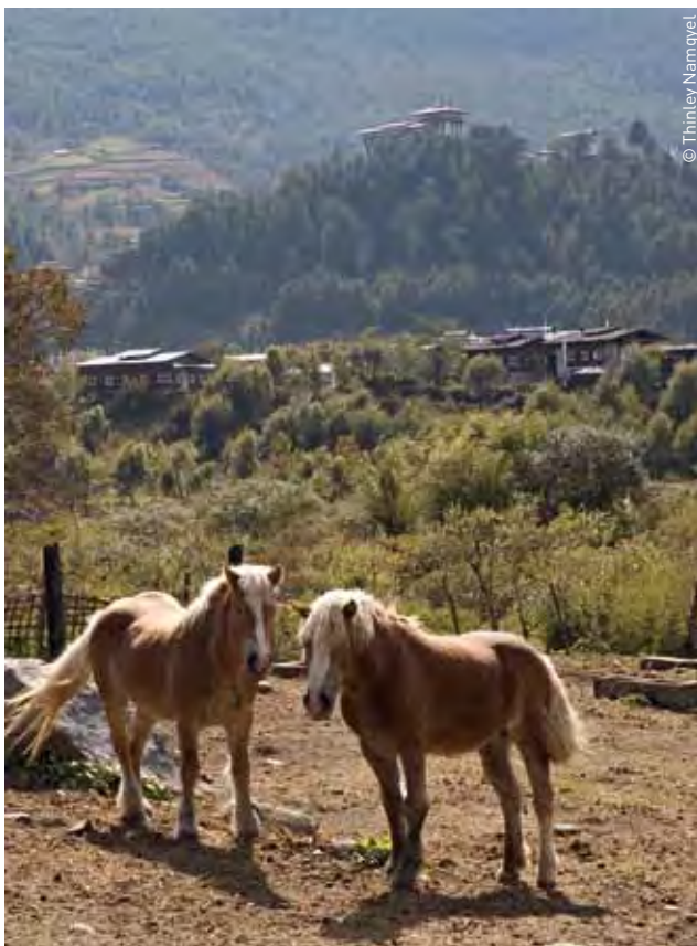
Two of the last Haflinger horses in Bumthang.