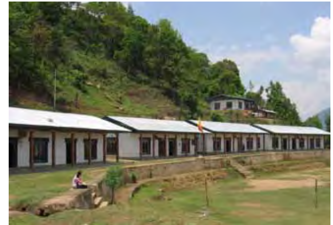
The Austria Bhutan society supports a rural primary school in Pangtokha.