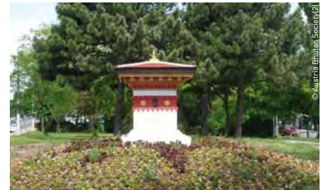
An original stupa built by students of the Secondary Technical and Vocational College Mödling.