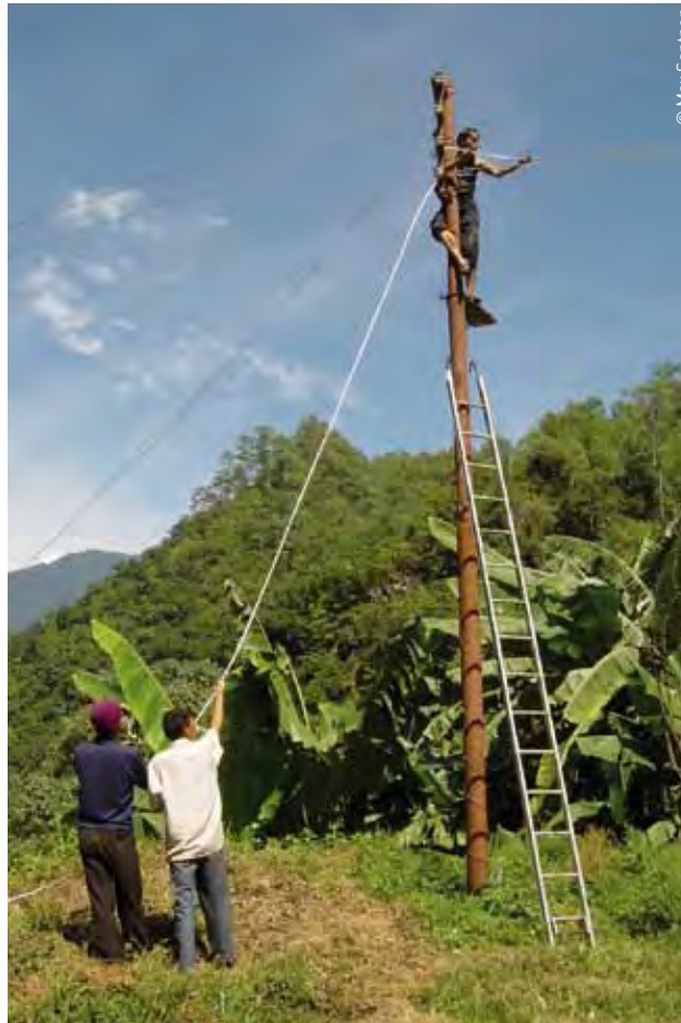
Rural electrification in Zhemgang.

Austrian Resident Coordinator from 1999 to 2004