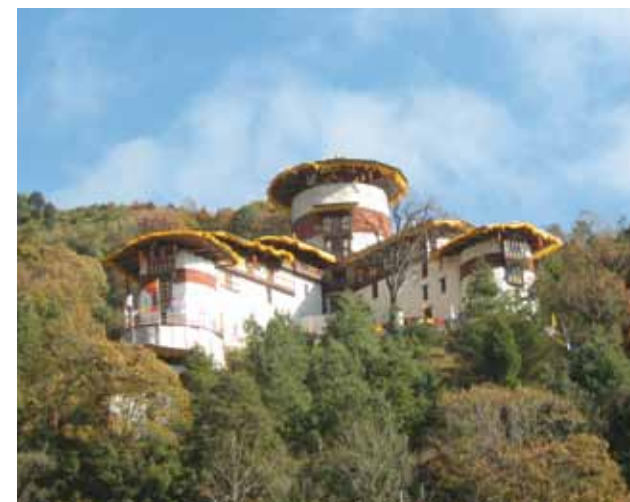
Inauguration of Ta Dzong 2006

The first inspection of the building's condition revealed poorly fitted rough stone laid in thick mud mortar, its massive walls had cracks and deep fissures indicating poor stone quality