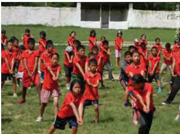
Volley for Health: First countrywide Mini Camp.